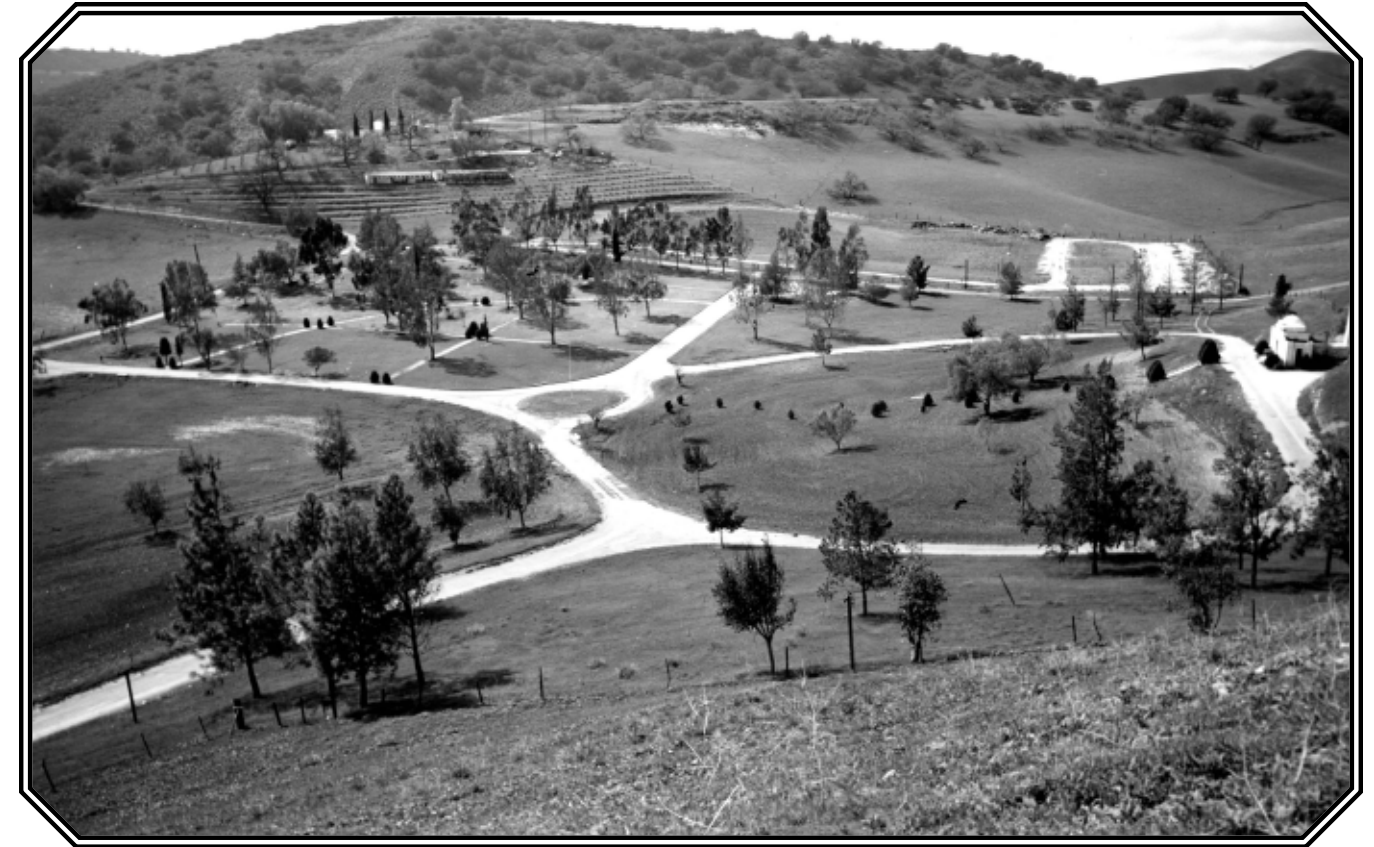
Photo of the park taken in the 1930's