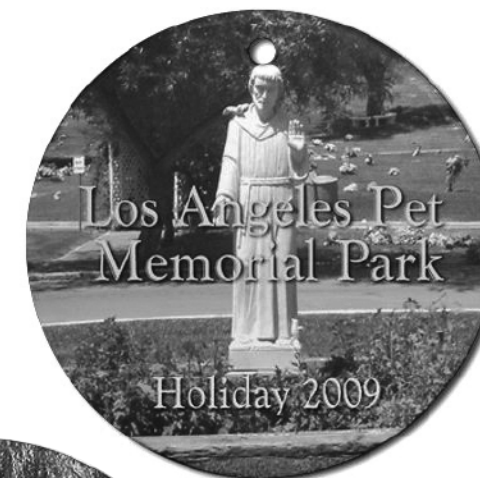
St. Francis Ornament

For the first time we are offering S.O.P.H.I.E. 2009 collectible porcelain holiday ornaments that we will be hand personalizing with your pet's name on the back. They are now on display at the Park. There are two designs available and they are only available this year. The are porcelain and just under 3" in diameter.