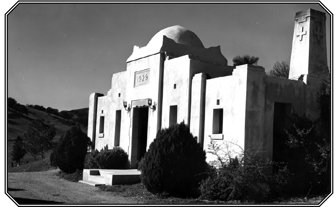
Photo of the Mausoleum