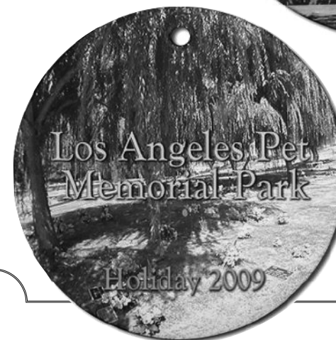
The Park Ornament